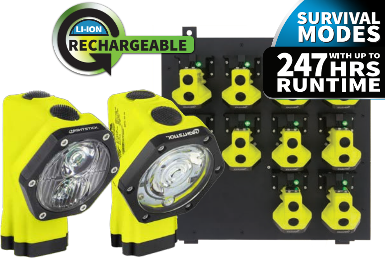
180L RECHARGEABLE Dual-Light XPR-5560G