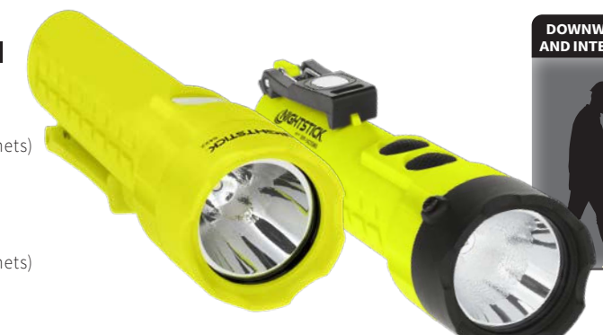
240L 3AA Dual-Light XPP-5422GA AVAILABLE IN