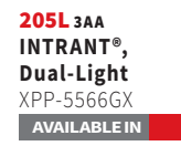
205L 3AA INTRINANT™, Dual-Light XPP-5566GX AVAILABLE IN