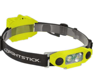
310L 3AA DICATA™, Dual-Light, Low-Profile XPP-5462GX AVAILABLE IN