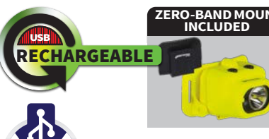
160L RECHARGEABLE (USB) Dual-Light, Magnetic charger, Zero-band hardware included XPR-5554G