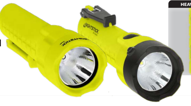
140L 3AA XPP-5420GA AVAILABLE IN