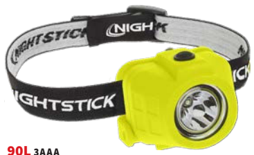
90L 3AAA XPP-5450G 180L 3AAA XPP-5452G