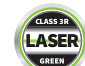
210L 3AA Light with Laser XPP-5422GXL

SIMULTANEOUS FLASHLIGHT AND LASER OPERATION