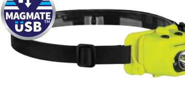
250L RECHARGEABLE (USB) Dual-Light, Zero-band hardware included XPR-5553G