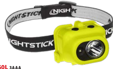
160L 3AAA Dual-Light XPP-5454G