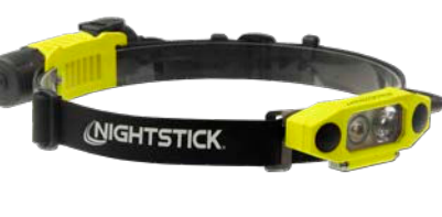
160L RECHARGEABLE (USB) Dual-Light, Zero-band hardware included XPR-5553G