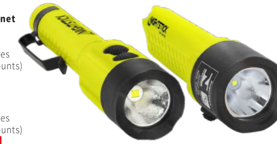
120L 2AA Dual-Light, Integrated magnet XPP-5414GX XPP-5414GX-K01 (Mount kit includes brim and slot mounts)