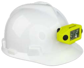
200L 3AAA Dual-Light, Zero-Band XPP-5460GCX