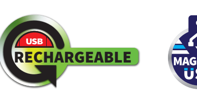
300L RECHARGEABLE (USB) DICATA™, Dual-Light, Low-Profile, Magnetic charger XPR-5562GX