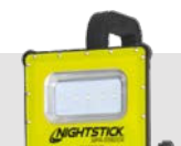
1200L RECHARGEABLE XPR-5592GX (Light and case)