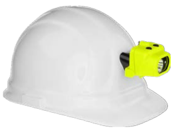
160L 3AAA Dual-Light, Zero-Band XPP-5454GC