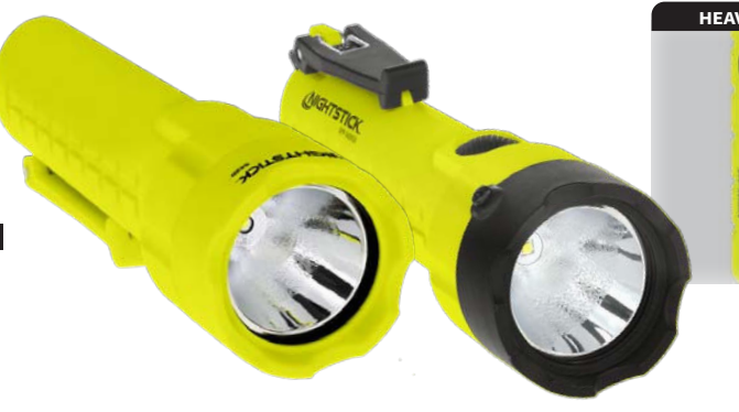
160L 3AA XPP-5420G AVAILABLE IN