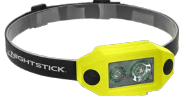
200L 3AAA Dual-Light, Low-Profile XPP-5460GX