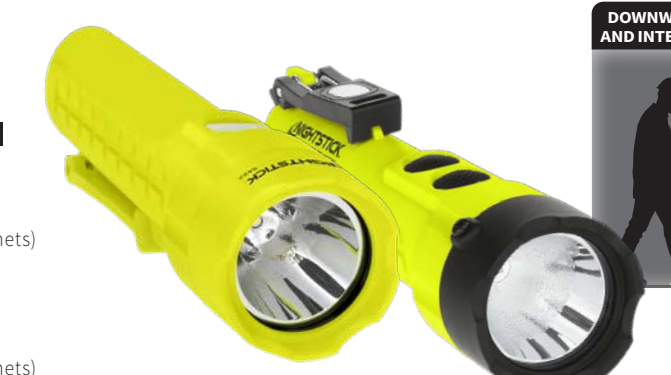
260L 3AA Dual-Light XPP-5422G AVAILABLE IN