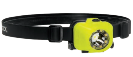
220L 3AAA Dual-Light, Zero-band mount included XPP-5453G