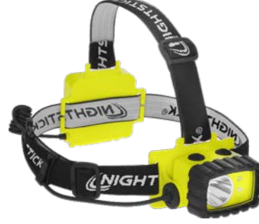
175L 3AA Dual-Light XPP-5456G (Red floodlight) 190L XPP-5458G (Green floodlight)