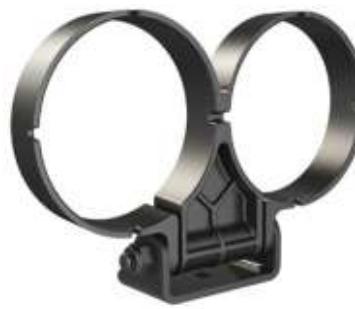
Double Lamp Pedestal