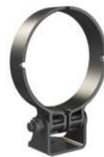
Single Lamp Pedestal