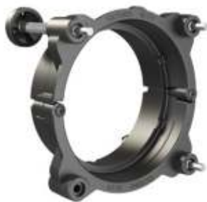
3-point Mount 3mm