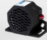
575 SURFACE MOUNT 12-24V | 107dB | 0.9A Compact size SAE Type B, CE, R10, UL