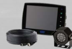
EC5603-K GEMINEYE™ 5.6" LCD COLOR SYSTEM Soft touch buttons on monitor Three camera expandable FCC, CE, R10, RCM, IP69K (camera only), RoHS