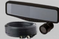
EC4200-K GEMINEYE™ 4.3" LCD COLOR MIRROR SYSTEM Integrated mirror | Flush mount camera Two camera expandable FCC, CE, IP67 (camera only), RoHS