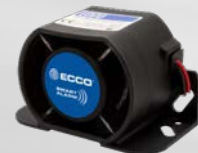
EA9724 SURFACE MOUNT 12-24V | 77-97dB | 0.7A Smart Alarm® | Multi-Frequency™ Alarm SAE Type F, CE, R10, IP64