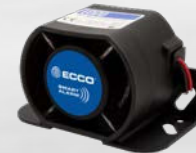
SA901N SURFACE MOUNT 12-24V | 82-107dB | 0.3A Smart Alarm® | Sealed in epoxy CE, R10, UL, IP64