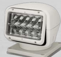
EW3011 TEN 5-WATT LEDs 12-24V | Spot | 5,357 Lumens 360° continuous rotation | 135° tilt range CE, IP68 (lighthead only)