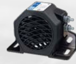
SA950 SURFACE MOUNT 12-24V | 82-102dB | 0.4A Smart Alarm® | Self grounding CE, R10, UL, IP65