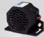
EA5200 SURFACE MOUNT 12-24V | 97dB | 1.0A Multi-Frequency™ Alarm SAE Type C, CE, R10, RCM, AMECA