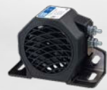
510 SURFACE MOUNT 12V | 97dB | 0.2A Compact size | Self grounding SAE Type C, CE, R10, UL, IP65, AMECA