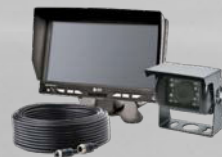
K7000B GEMINEYE™ 7" LCD COLOR SYSTEM 18 Infrared LEDs | Sunshade Included Two camera expandable FCC (camera only), CE, IP69K (camera only), RoHS