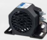
530 SURFACE MOUNT 12-24V | 102dB | 1.0A Compact size | Self grounding SAE Type F, CE, R10, UL, IP65, AMECA