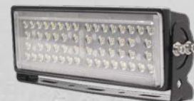
EW4030 FIFTY-SIX 1.5-WATT LEDs 12-24V | Flood | 4,950 Lumens Deutsch connector | 170° articulated mount CE, R10, IP67, RoHS