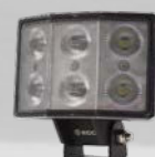
EW2530 SIX 10-WATT LEDs 12-24V | Flood | 3,750 Lumens Deutsch connector | 120° beam pattern CE, R10, CISPR25, IP67, IP69K, RoHS