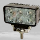
EW2411 SIX 3-WATT LEDs 12-24V | Flood | 1,000 Lumens Polycarbonate lens CE, R10, IP67, RoHS