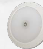
EW0200 SURFACE MOUNT 12-24V | 0.4A | 425 Lumens Flood | Switched CE, RoHS