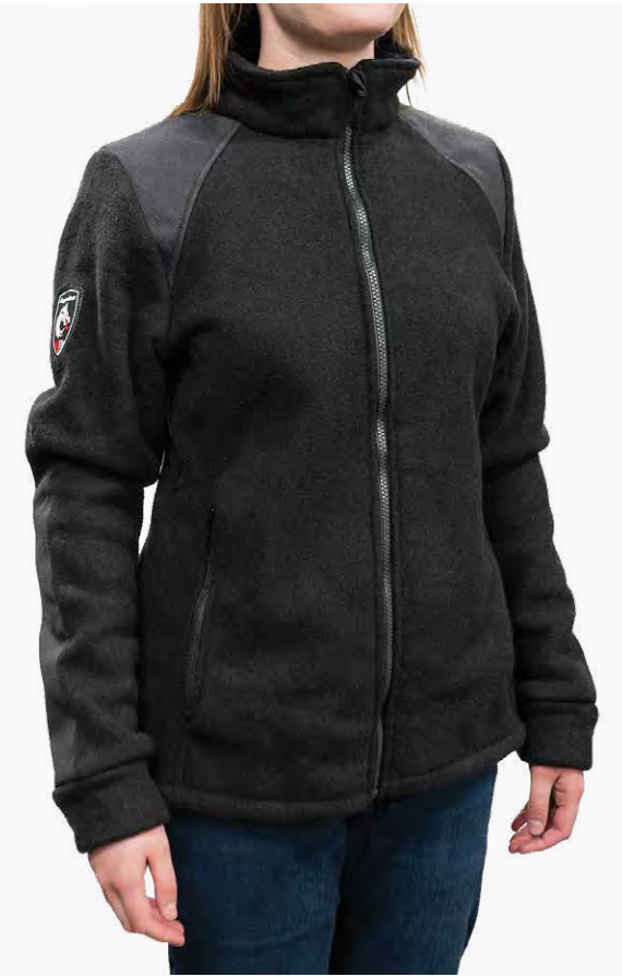
EXXTREME™ JACKET (WOMEN'S)