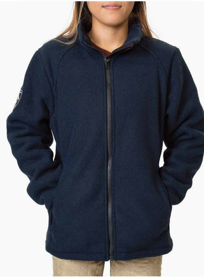
ALPHA™ JACKET (WOMEN'S)