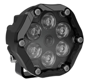
TRAIL 6 FLASH