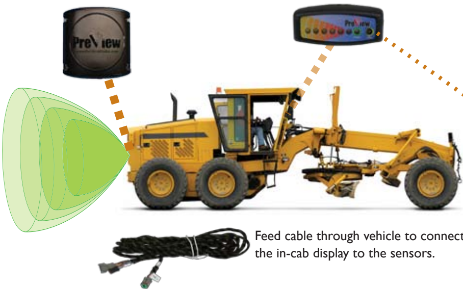
Feed cable through vehicle to connect the in-cab display to the sensors.